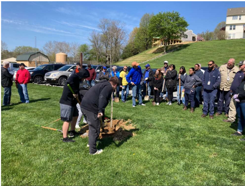
Tree planting demonstration at Arbor Day event