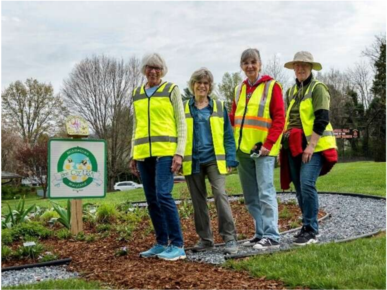
Some of our committee members at the newly established pollinator garden