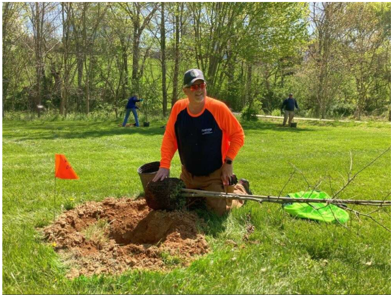
Potomac Edison employees planting trees at Arbor Day event